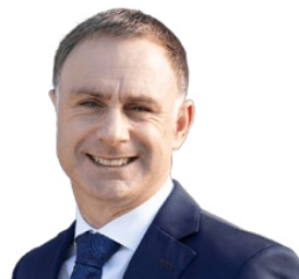
Hon Chris Bishop Minister Responsible for RMA Reform

A handwritten signature in black ink, appearing to read 'Simon Watts'.